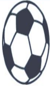
SOCCER / FOOTBALL